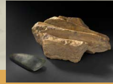
polisher and polished stone axe