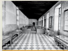
museum in 1955