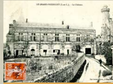
villagers in the chateau