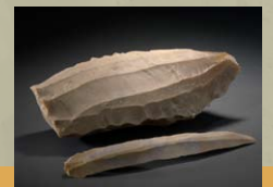
« pound of butter » and blade