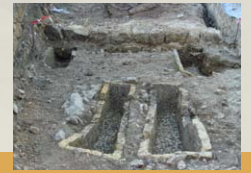
sarcophagi from the chateau