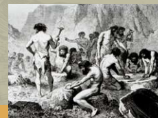
19 th century's view