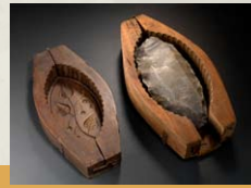
moulds and pound of butter !