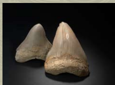
teeth of white sharks